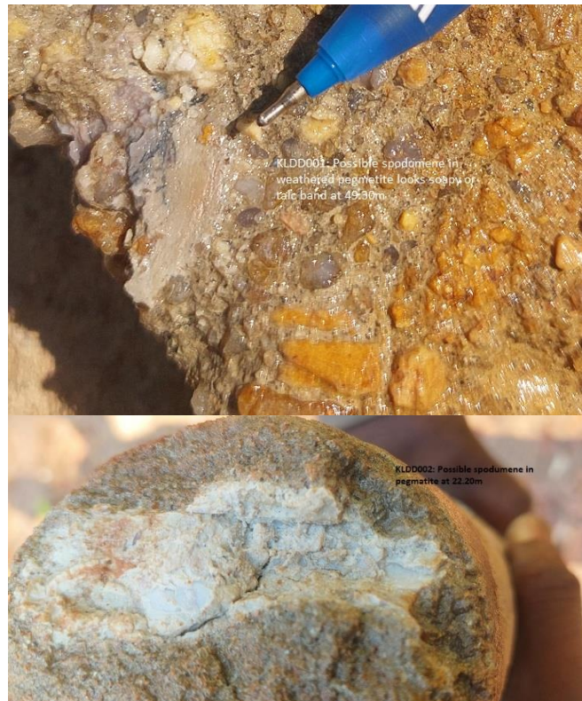
Figure 3: Highly weathered Spodumene Minerals identified in the drill Core.

One RC hole, KLRC015, which was drilled under alluvial artisanal workings on line 1000N (Figure 1), intersected 25m of massive quartz from surface. Results from grab samples collected from the workings reported lithium grades of up to 0.04% lithium and up to 0.18% tin in highly weathered pegmatite boulders. The assay results and abundance of quartz in the drill chips suggest a second pegmatite zone potentially exists within granites to the east of the interpreted continuation of the main Manono pegmatites.